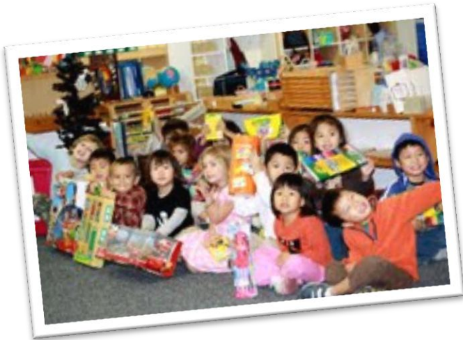
Preschoolers prepare the toys for delivery to the local fire station during the Spark of Love Toy Drive.

Thank you to everyone who filled the bin with toys.