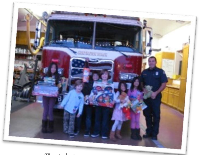
The students were met with a special treat as they delivered toys on behalf of their friends in school. The firefighter greeted them and invited them to see the fire truck.