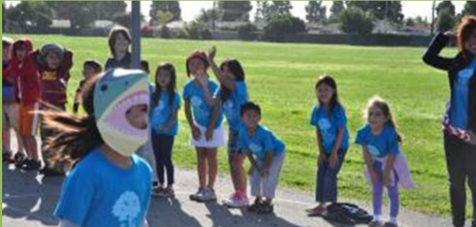
Our shark, Cassidy leads the "wave" during the Pep Rally