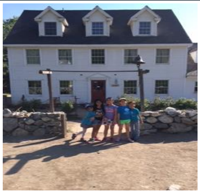
The upper elementary students had an amazing time at Riley's Farm.

Registration for new students is now open. Please be sure to turn in your registration form if you plan to attend in September to guarantee your child's space.